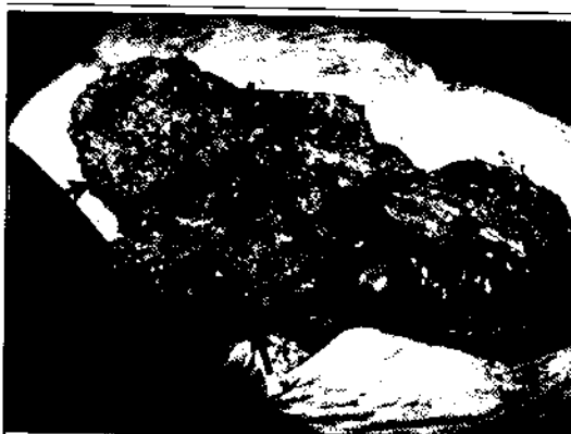
Figure 1. Typical Intraoperative Appearance of Stage III Epithelial Ovarian Cancer.

If ovarian cancer is suspected on the basis of symptoms and physical examination, transvaginal ultrasonography is often performed for further evaluation of the pelvis. Transvaginal ultrasonography appears to be more sensitive than computed tomographic (CT) scanning for the detection of pelvic masses, and it provides qualitative information about the mass that is useful for further management decisions. 38,39 Specifically, the finding of a complex ovarian cyst, defined by the presence of both solid and cystic components, sometimes with